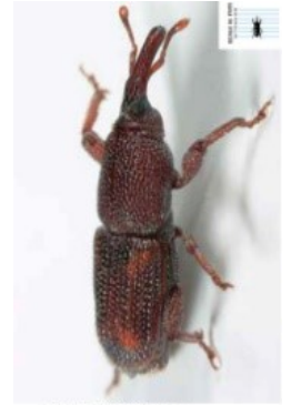
Rice Weevil ( Sitophilus oryzae )

There are also other insects that can pose an issue. Below are some simple steps that can be taken to protect grain in storage: