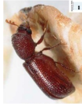
Lesser Grain Borer ( Pyssiphenia oblonga )