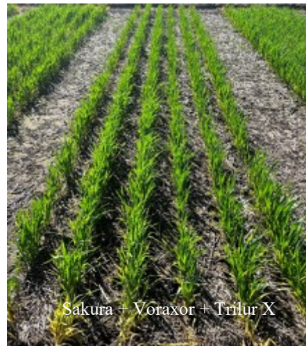
Sakura + Voraxor + Trilur X

Our fungicide trial has been very informative on the back of last seasons heavy disease pressure. The aim was to identify what fungicide products showed the best efficacy on powdery mildew when applied from GS31 onwards. We applied 24 different treatments to the wheat this season with the stand outs being the new permitted products; Vivando from BASF and Talendo from Corteva, which took our powdery mildew levels from very severe down to basically nothing. There were also some big differences between the mixes early in the season which are quite interesting.